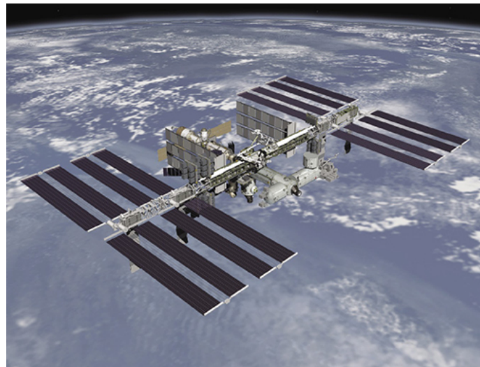
Solar arrays like these, attached to the ISS, will be increasingly important to NASA as the Agency works to travel deeper into space.