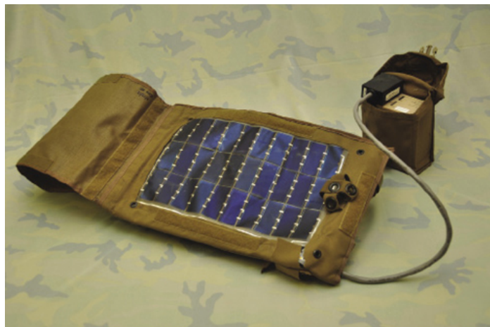
Troops in desert regions already are using MicroLink Devices' flexible, lightweight solar arrays as a source of portable, renewable energy. The panels attach to a backpack and are capable of charging military batteries, eliminating the need to carry extra ones.