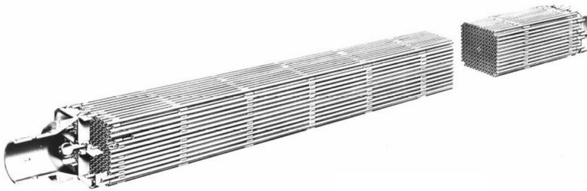
Figure 3. A nuclear fuel bundle for a PWR. [7]