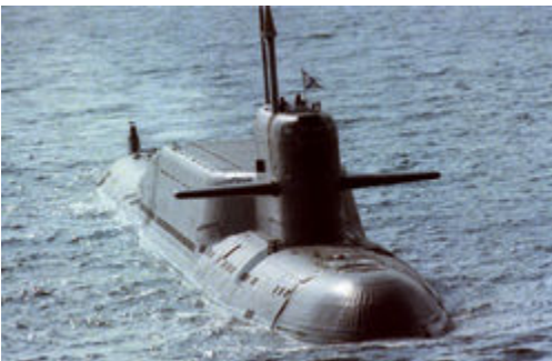
Figure 2. Nuclear submarines make use of the high power-to-weight ratio of PWRs in their operation. [2]

Figure 1. The Watts Bar Nuclear Generating Station in Tennessee uses PWRs in its operation. [1]