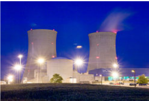
Figure 1. The Watts Bar Nuclear Generating Station in Tennessee uses PWRs in its operation. [1]