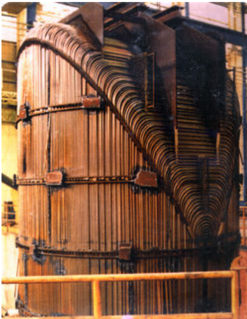
Figure 4. The inverted U-tube bundle in the steam generator of a PWR. [9]

As the name implies, the water in the reactor is pressurized. This is due to the fact that as the pressure gets higher, the boiling point of water increases with it. This means that at high pressures the water can operate at extremely high temperatures without boiling to steam . This is important for the reactor as higher pressures allow for greater power output and higher thermal efficiency . [10] The pressure is maintained by the "pressurizer" (Figure 4), which acts to stabilize pressure changes caused by changes in electrical load. [3]