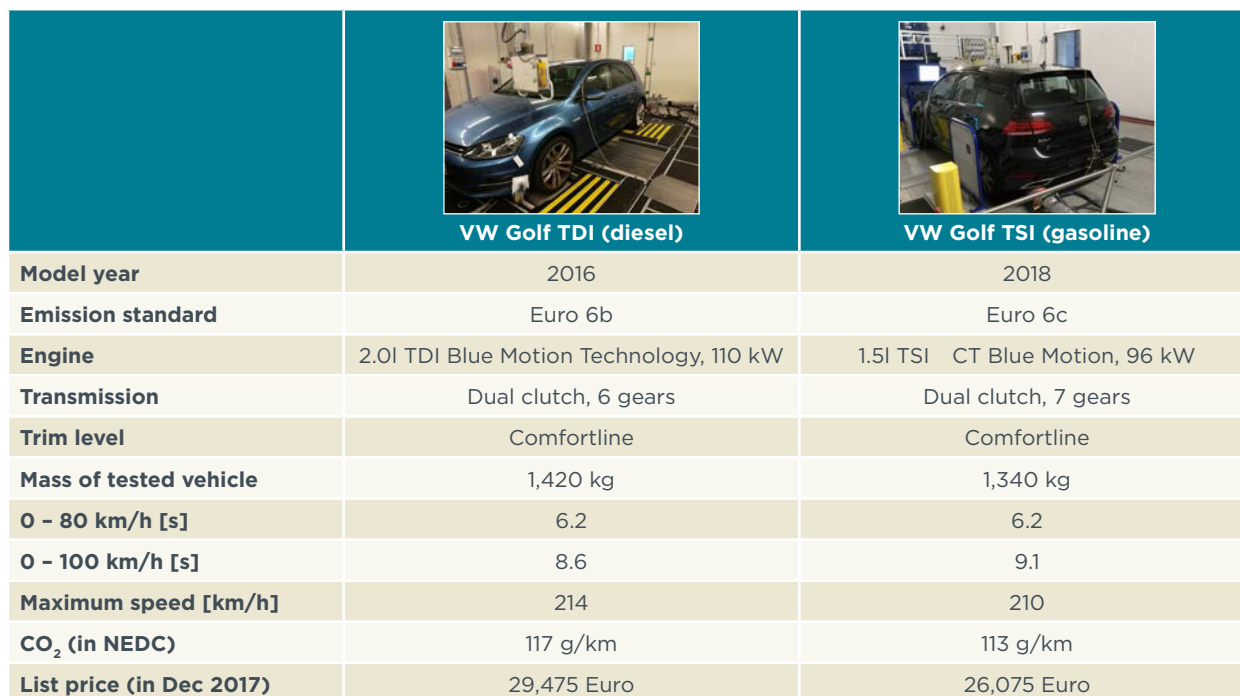
Table 1. Key characteristics of the two test vehicles.

Two VW Golfs were selected for testing, one diesel (TDI) and one gasoline (TSI) version. The key characteristics of both vehicles are summarized in Table 1. Both vehicles are rental cars that were type approved according to the Euro 6 emission standard and following the New European Driving Cycle (NEDC) procedure. Both vehicles came to the market prior to the introduction of the Worldwide harmonized Light vehicles Test Procedure (WLTP) and the EU's Real Driving Emissions (RDE) not-to-exceed limits for nitrogen oxide (NO x ).