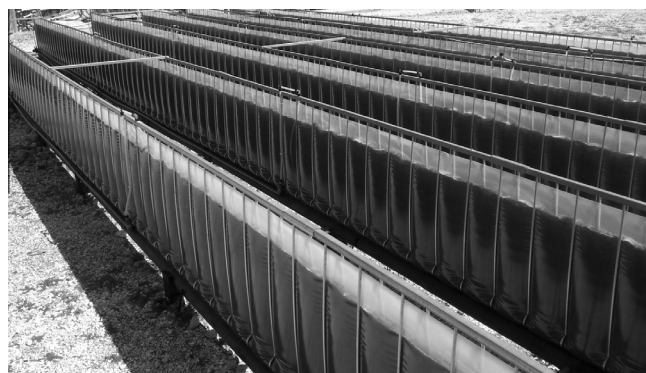
Fig. 2. GWP-II photobioreactor at the F&M facility in Sesto Fiorentino (Italy).

by F&M in FP7 EU projects (BIOFAT and FUEL4ME) and for the commercial production of microalgae biomass at Microalghie Camporosso S.r.l. It is also used by companies in several R&D projects (in Chile, Portugal, Sweden, Saudi Arabia, Italy). The original GWP design, the GWP-I [10], has been improved in order to reduce its embodied energy and cost [25]. In the new design (GWP-II) (Fig. 2) the plastic culture chamber is contained by a number of vertical stainless-steel uprights directly driven into a wooden base and connected at the top by a horizontal stainless-steel bar so as to form a unique frame [25]. The removal of the grids and the reduction of the culture chamber height from 1 to 0.7 m have allowed the construction of a much lighter metal frame, decreasing in this way the energy associated with reactor materials and reactor cost. The culture chamber is made of a flexible, PAR-transparent (>90%),